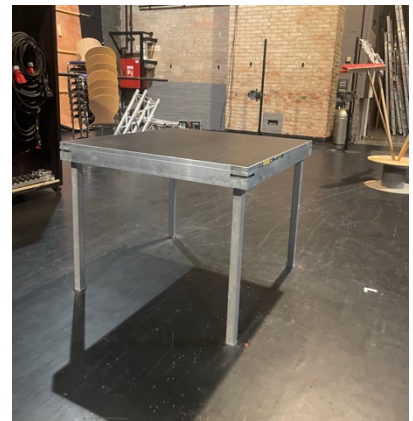
3 / table