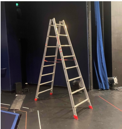
1 / ladder