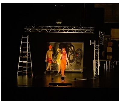
6 / truss fly