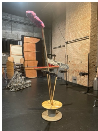
7 / brooms and mop