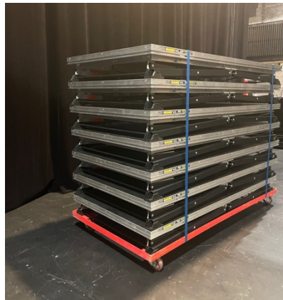
2 / platform stack