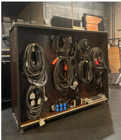
4 / cable Trolley