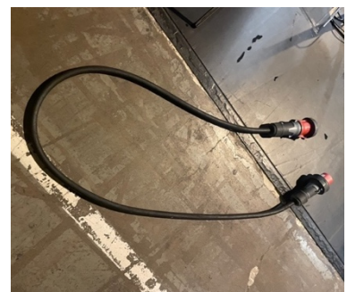
8 / cable CEE63