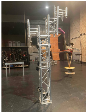
5 / truss tower