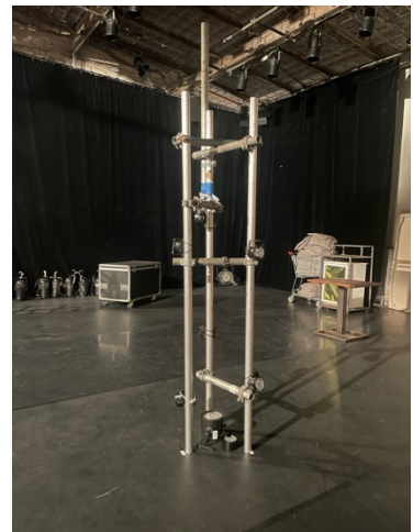
5-alt / scaffolding